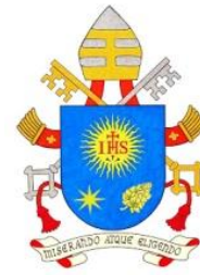
Pope Francis Vatican City State

Sacrament of Reconciliation Saturday 4:30-5:30 p.m. Wednesday 6:00-6:30 p.m. First Friday 4:00-5:30 p.m.